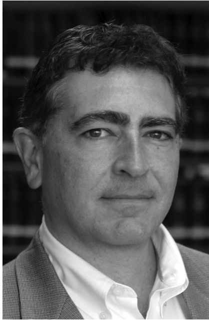
Saul M. Kassin

Finally, on October 3, 2011, after having been granted a new trial, they were acquitted. Ten weeks later, the Italian appeals court released a strongly worded 143-page opinion in which it criticized the prosecution and concluded that there was no credible evidence, motive, or plausible theory of guilt. For the four years of their imprisonment, this story drew international attention (for comprehensive overviews of the case, see Dempsey, 2010, and Burleigh, 2011). 1